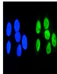
IF analysis of hnRNP D/AUF1/HNRNPD using...