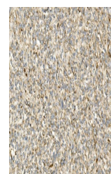
IHC analysis of DDIT3 using anti-DDIT3 a...