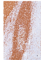
IHC testing of human tonsil with PAX5 antibody.