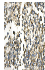
IHC analysis of AKR7A2 using anti-AKR7A2...