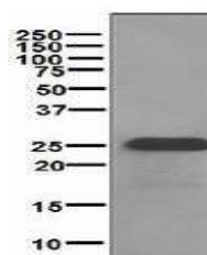
Western blot analysis on SH-SY-5Y cells ...