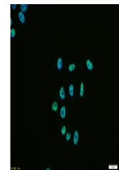
ICC analysis of HeLa cell using KLF4 mon...