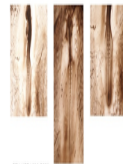
Chicken embryos, Primary antibody: 1:100...