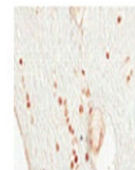
Sample Type: Human Optic Nerve and Spina...