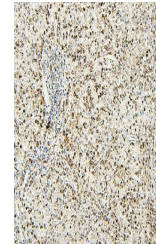
IHC analysis of NR1I2 using anti-NR1I2 a...