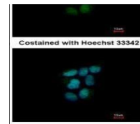
Immunofluorescence analysis of A431 cell...