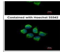
Immunofluorescence analysis of A431 cell...