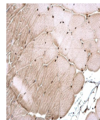
Immunohistochemical staining of mouse mu...