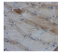
Immunohistochemical staining of rat musc...