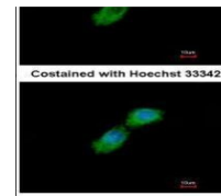
Immunofluorescence analysis of A549 cell...