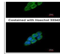
Immunofluorescence analysis of A431 cell...