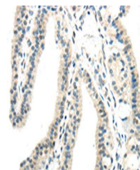
Immunohistochemistry of paraffin-embedde...