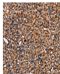
Immunohistochemistry of paraffin-embedde...