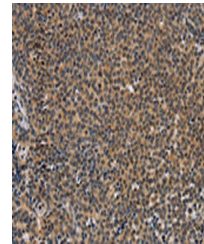
Immunohistochemistry of paraffin-embedde...