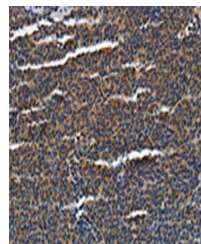
Immunohistochemistry of paraffin-embedde...