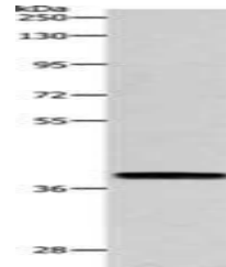
Western blot aanalysis of RAW264.7 cells...