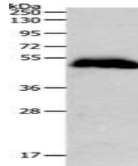
Western blot aanalysis of Human liver ca...