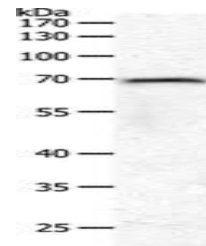
Western blot aanalysis of Hela cellsusin...