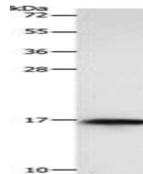
Western blot aanalysis of Human fetal br...