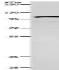
Western blot aanalysis of 231 cellsusing...