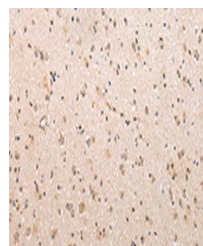
Immunohistochemistry of paraffin-embedde...