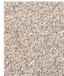
Immunohistochemistry of paraffin-embedde...