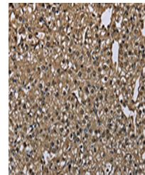
Immunohistochemistry of paraffin-embedde...