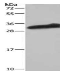
Western blot aanalysis of Human testis t...