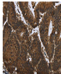
Immunohistochemistry of paraffin-embedde...