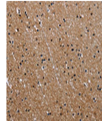
Immunohistochemistry of paraffin-embedde...