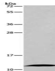
Western blot aanalysis of Mouse small in...