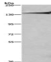
Western blot aanalysis of 293T cellsusin...