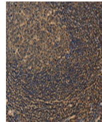
Immunohistochemistry of paraffin-embedde...