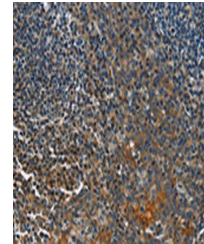
Immunohistochemistry of paraffin-embedde...