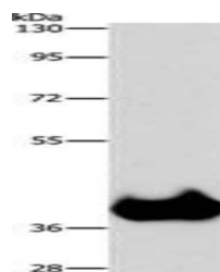
Western blot aanalysis of Mouse brain ti...