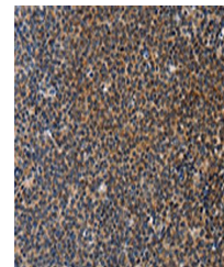
Immunohistochemistry of paraffin-embedde...