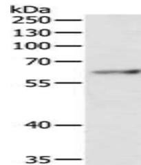
Western blot aanalysis of Jurkat cellsus...