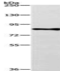
Western blot aanalysis of Mouse thymus t...