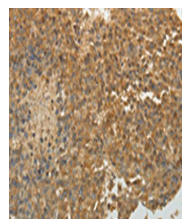
Immunohistochemistry of paraffin-embedde...