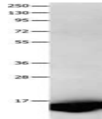
Western blot aanalysis of Human fetal br...