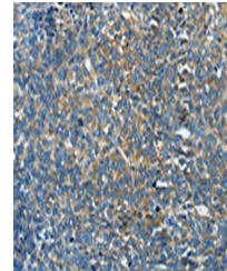
Immunohistochemistry of paraffin-embedde...