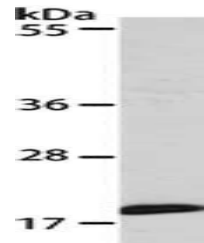
Western blot aanalysis of 293T cellsusin...