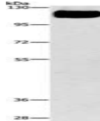
Western blot aanalysis of K562 cellsusin...