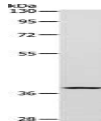
Western blot aanalysis of Mouse brain ti...