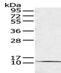
Western blot aanalysis of Human fetal in...