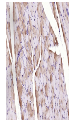
IHC-P analysis of rat skeletal muscle us...