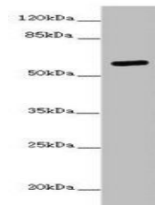
Western blot analysis of Mouse brain tis...