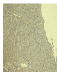
Immunohistochemical staining of Rat Live...