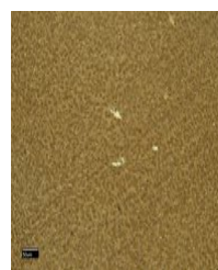
Immunohistochemical staining of Rat Live...