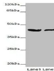
Western blot analysis of MCF-7 whole ce...