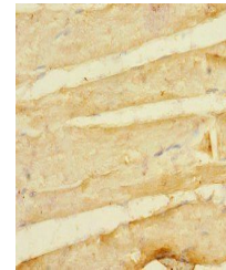
Immunohistochemical staining of human sk...