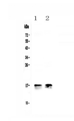
WB analysis of COX IV using anti-COX IV ...